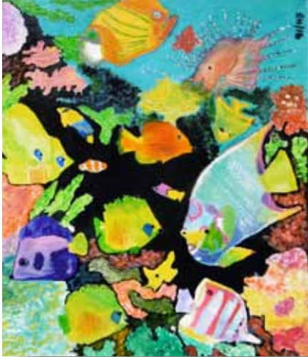
▲ Eileen Halliwell