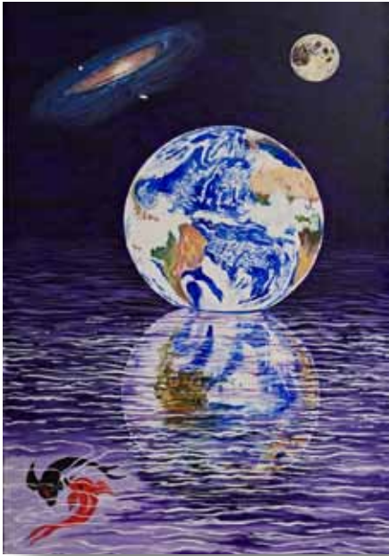
▲ Ian Trotman