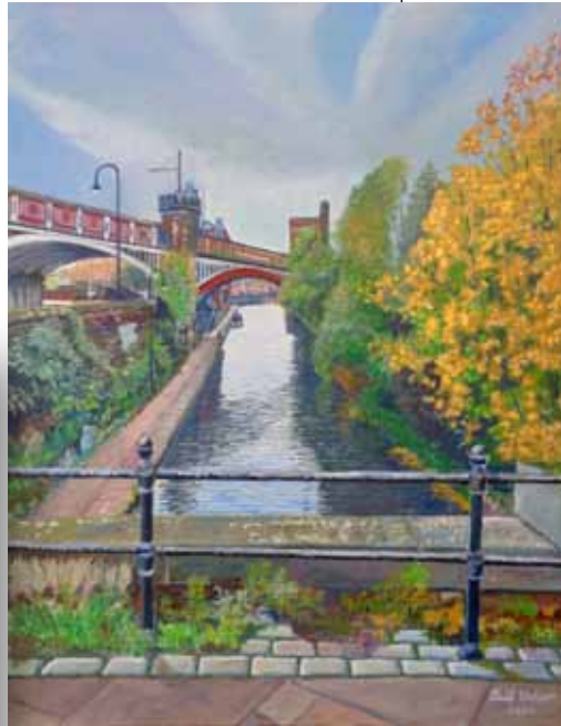
▼ Bill Usher 'Rochdale Canal Castlefield' Acrylic