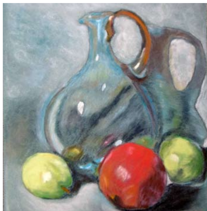
▲ Eileen Halliwell 'Three apples' Pastel pencils.