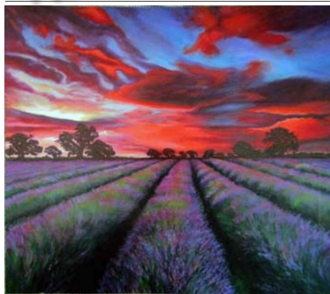
▲ Dan Thewlis 'Somerset Lavendar' Acrylic on acrylic paper. Dan says 'My first attempt at a landscape and it was a pleasure to paint.' Well, it's also a pleasure to look at!