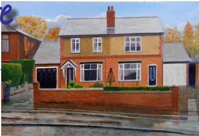
Bill Usher ▶