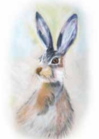
▲ Eileen Halliwell 'Big Ears' Pastel.