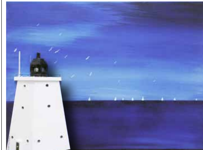
▼ Kath Rowlands 'Lighthouse Blues' 3D Acrylic.