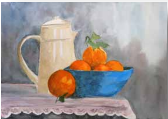
▲ Sylvia Harding Watercolour